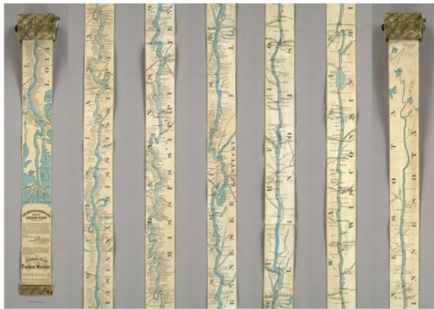
A ribbon map from the 1860s that unspools to show the Mississippi River